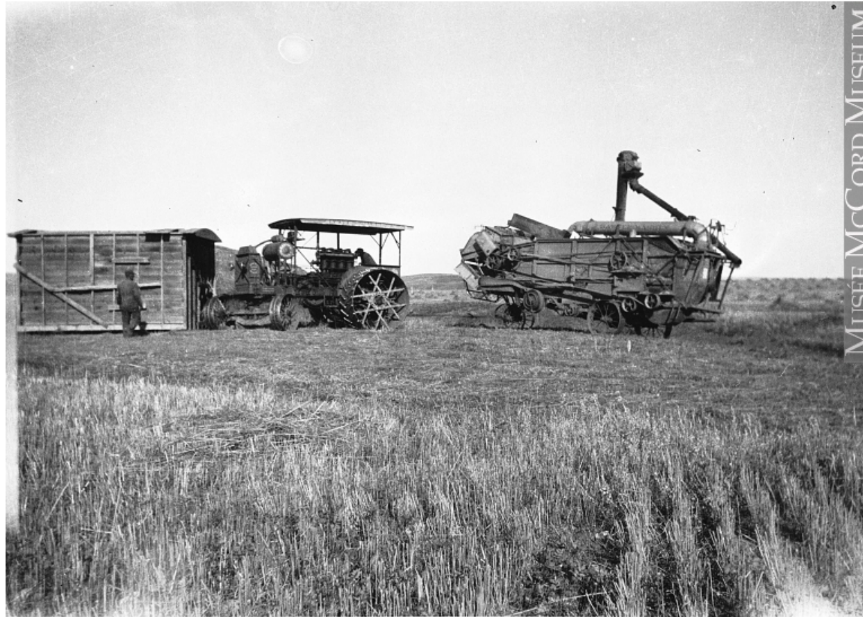
Threshing in the Prairies, 1930-40.