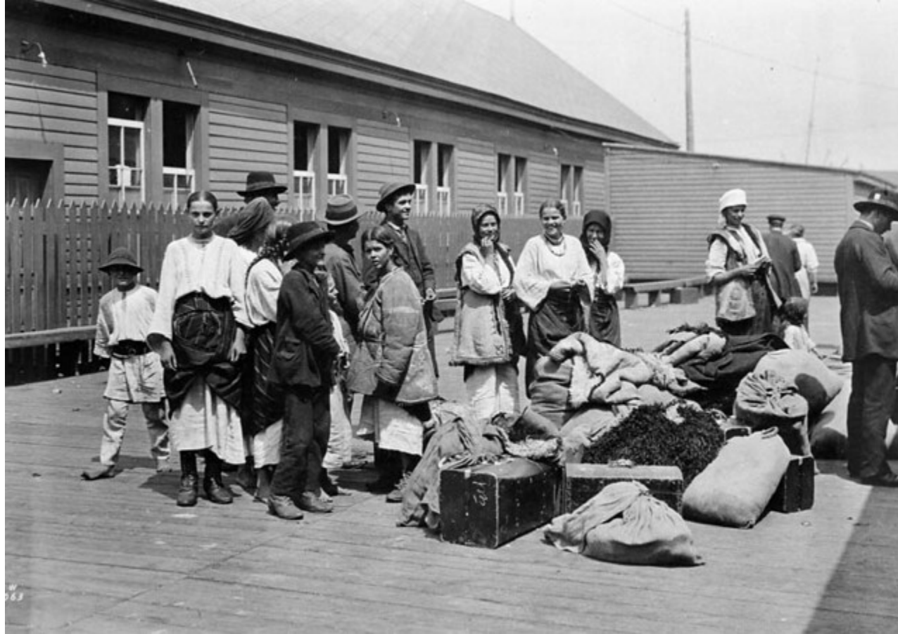
Galician immigrants at Quebec. ID 495065.