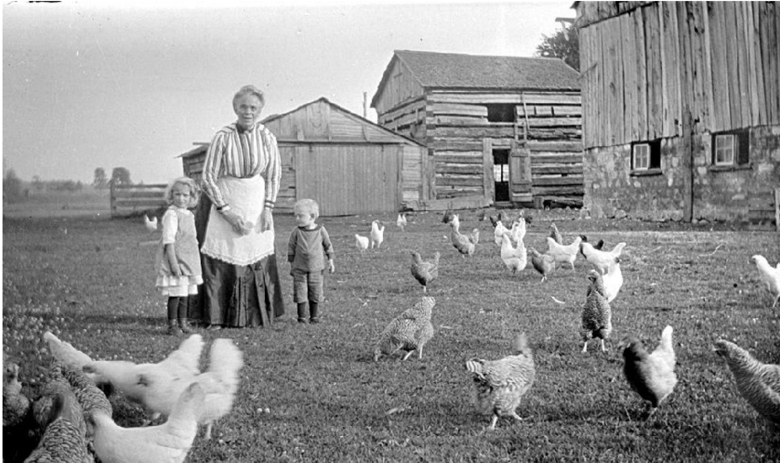
Woman and two young children standing in a farm yard, with chickens, [ca. 1900].