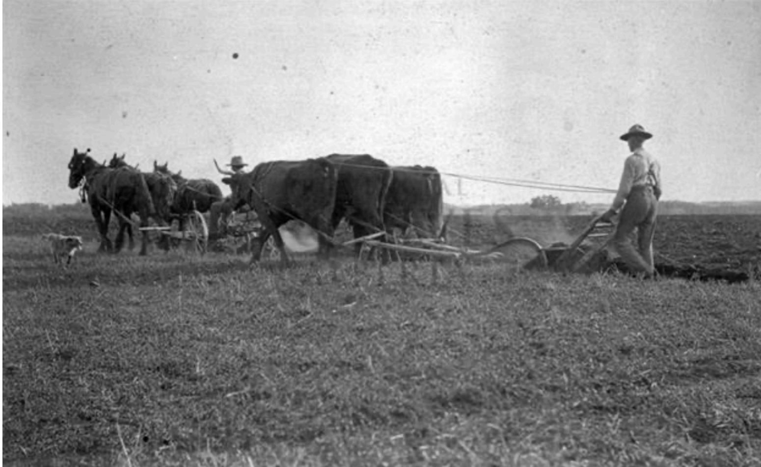
Breaking sod, Camrose, Alberta, 1900.